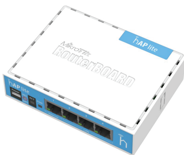
The router for my apartment